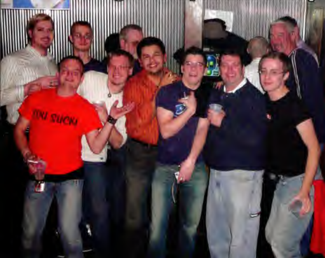
Triangle Gay.com Party