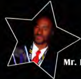
MIAH Mr. ICON 2007