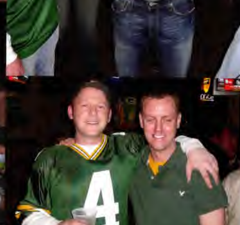
Above: Packer Playoffs @ Woody's Below: Babylon @ Redlight