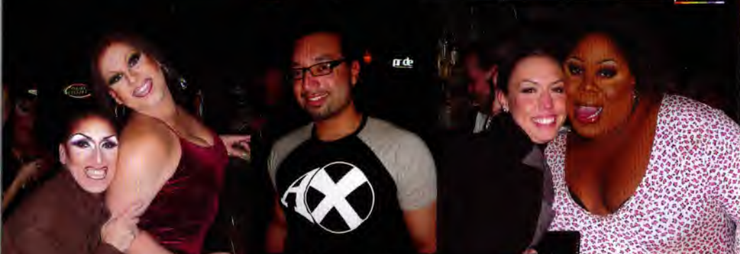
Triangle with the Tauca Boys