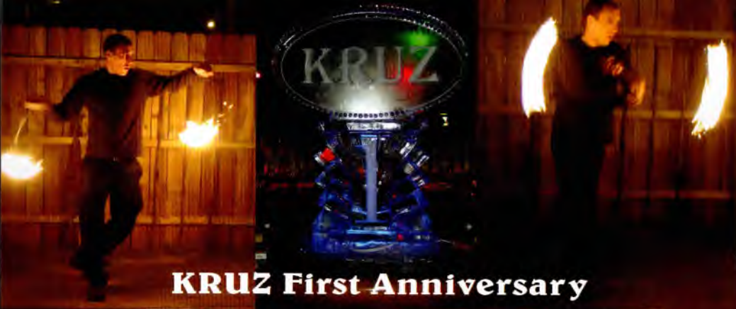
KRUZ First Anniversary