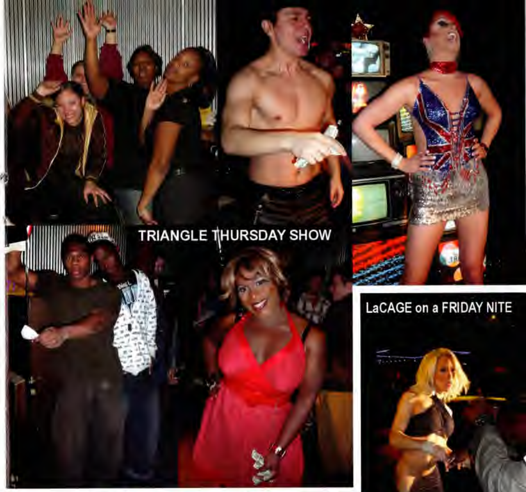
TRIANGLE THURSDAY SHOW

OutBound Magazine is published monthly by Za's Publications. © 2007, Za's Publications, all rights reserved. Distributed FREE at selected GLBT friendly businesses. Reproduction in part or whole is strictly prohibited unless consent is given expressly by the publisher. OutBound's use of photos or accompanying editorial material does not imply any sexual orientation of people or businesses depicted or mentioned within said photos or editorial material. OutBound does not assume responsibility for statements by advertisers. All unsolicited photographs, letters and editorials are subject to OutBound's right to copyright and publish with rights to change, edit or comment.