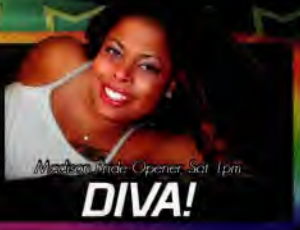
Madison Pride Opener, Sat. 1pm