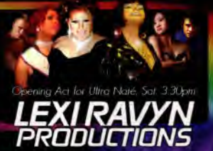
Opening Act for Ultra Naté, Sat. 3:30pm