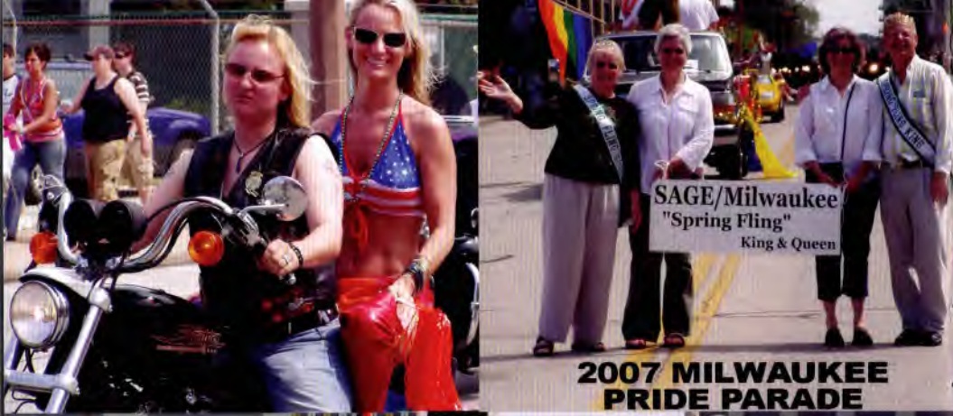
2007 MILWAUKEE PRIDE PARADE