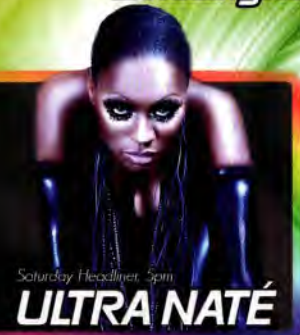
Saturday Headliner, 5pm

Check out www.madisonpride.org or www.myspace.com/madisonpride for more info on Pride Weekend in Madison!