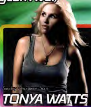
Sunday Headliner, 5pm