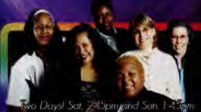
Two Day! Sat. 2:15pm and Sun. 1:45pm