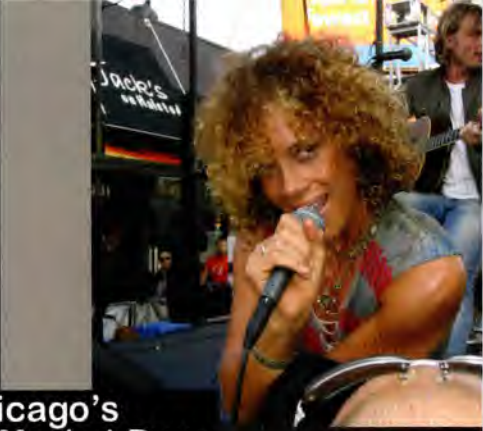
Chicago's Halsted Market Days