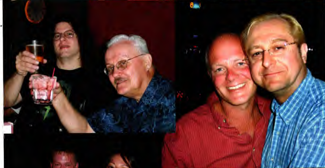
"The Room" Anniversary Party