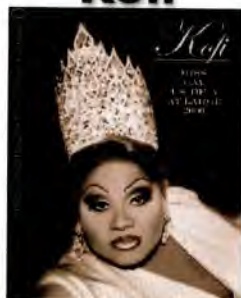
Miss Gay USofA At Large 2000