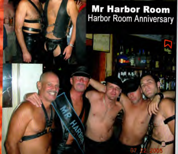
Mr Harbor Room Harbor Room Anniversary