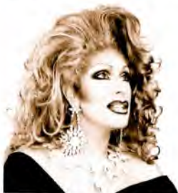
Miss Gay America 2002