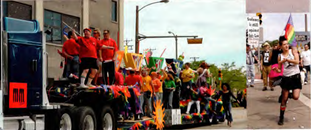
MILWAUKEE'S LGBT PRIDE PARADE