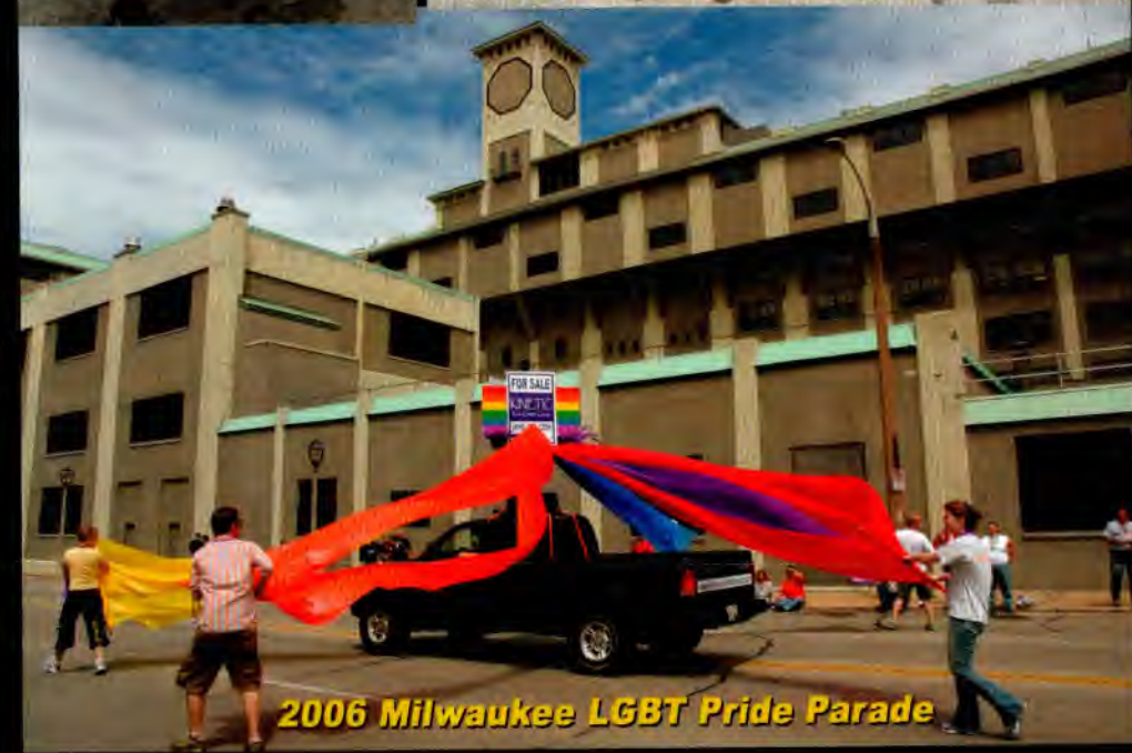
2006 Milwaukee LGBT Pride Parade