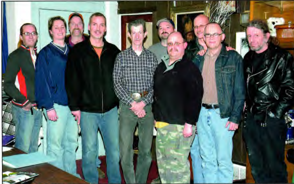
The Milwaukee Pride Parade committee is meeting frequently putting final details concerning the parade together. The parade will be Sunday, June 11, 2 pm.

Do you have piercings? You know you do! And even if you can't tell your other half, TELL ME! Send your questions, comments, and suggestions to avantgarde@voyager.net and put Skin and Steel in the subject line.