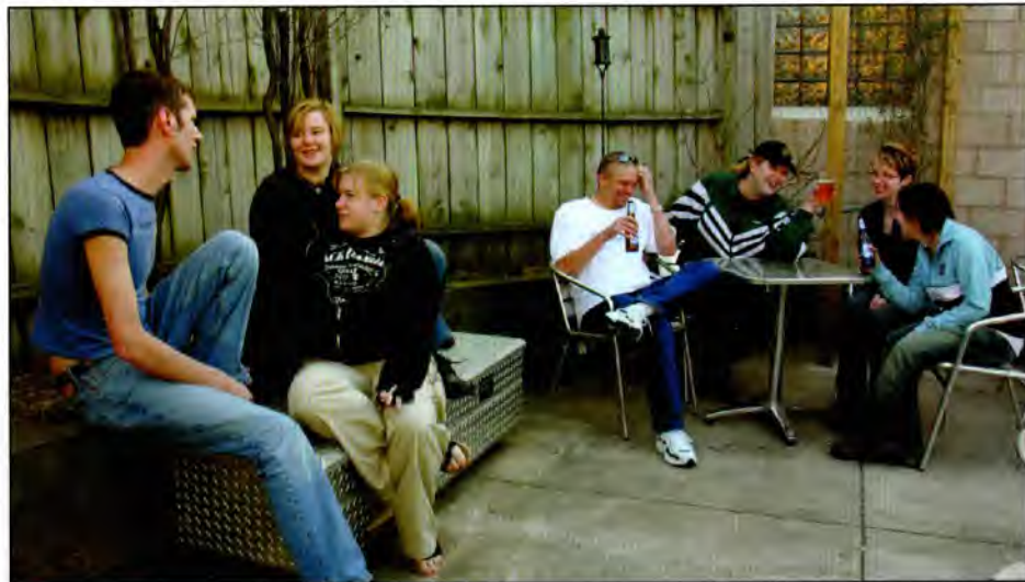
Below: The weather warms up and customers take to the patio at Triangle Bar.