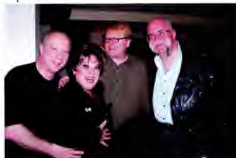
The 2006-2007 Season for The M&I Bank Broadway in Milwaukee Series was announced: