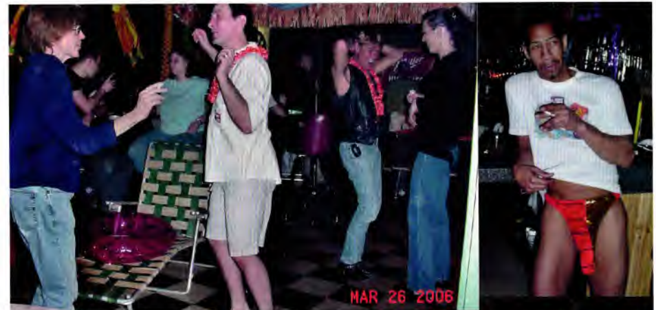
City Lights Chill hosted both a Beach Party and a Uniform Party in March. The crowd was quite mixed for the beach party.