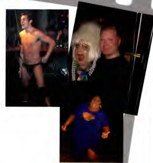
LaCage's 21st Birthday Party