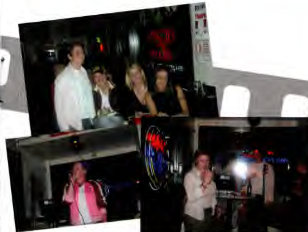
Karaoke Party @ the Pint