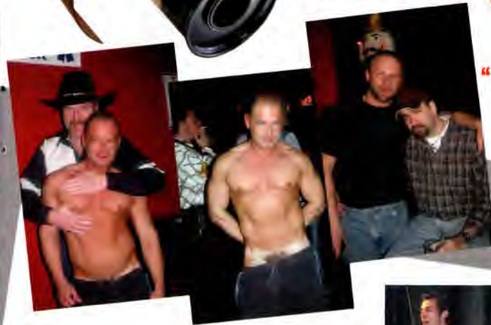
"HANGING OUT" at BOOM