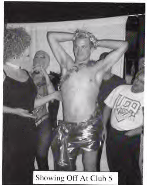
Showing Off At Club 5