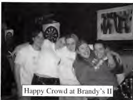
Happy Crowd at Brandy's II