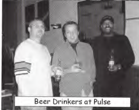
Beer Drinkers at Pulse