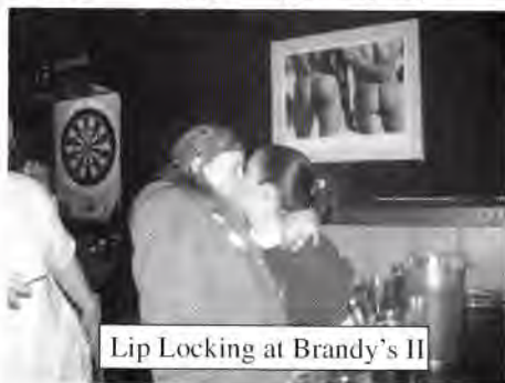
Lip Locking at Brandy's II