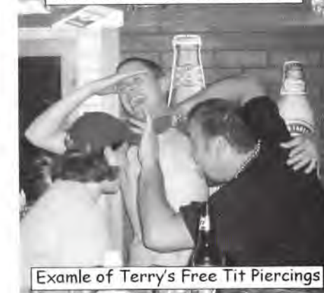
Examlpe of Terry's Free Tit Piercings