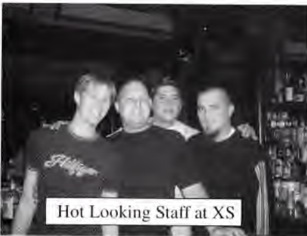
Hot Looking Staff at XS