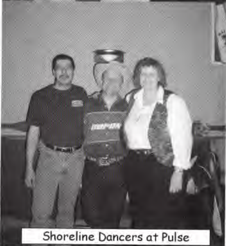
Shoreline Dancers at Pulse