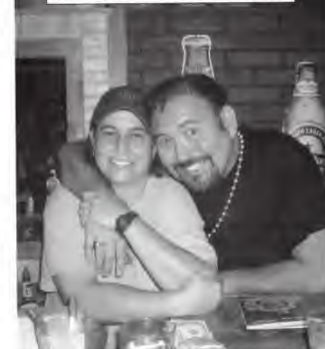
You Know Who at the Shamrock