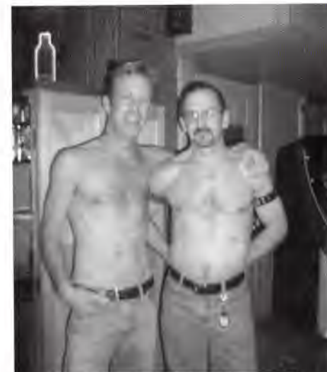
Bare Chested at the Shamrock