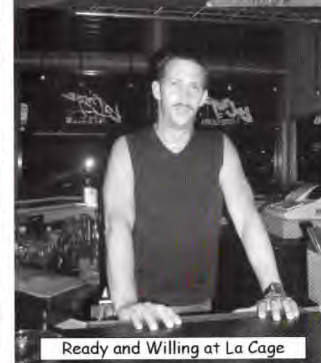
Ready and Willing at La Cage