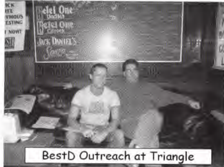
BestD Outreach at Triangle