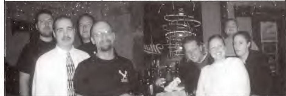
Docks' Dart Team at Switch