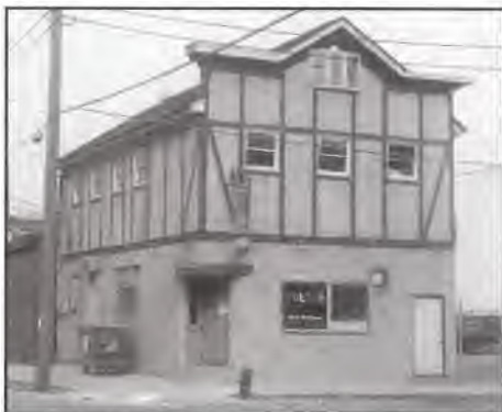
Pulse, 200 E. Washington

Milwaukee's latest, newest club, Pulse, has made a major transformation from a women's bar to a all-around gay bar where everyone is welcome. Leather, drag, country-western, sports or dance, there is something for everyone at Pulse. Renovations to the club have lent a favorable atmosphere to a variety of new activities. Including classic rock nights, karaoke, latin salsa, roaring 20's gangsta parties and more. The latest addition is their hot new pulsating all-male revue on Sunday nights. There is nothing else like it in Milwaukee. These performers are hot and eager to please.