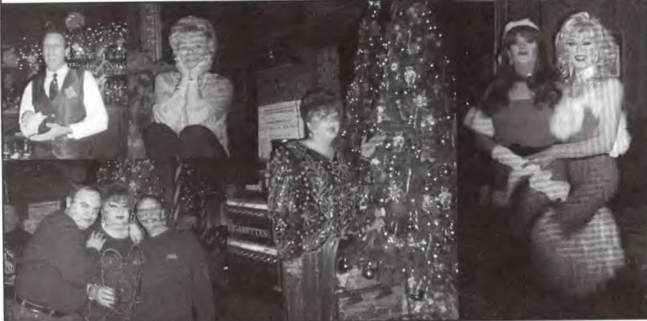
↓ Holiday Cheer at Harbor Room ↓