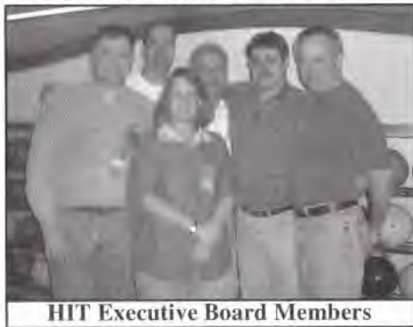
HIT Executive Board Members

HIT announces the elections of its Executive Board of Directors for 2003-2004