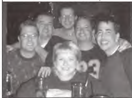
Good Times at Triangle