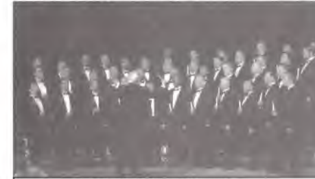
Men's Voices Milwaukee