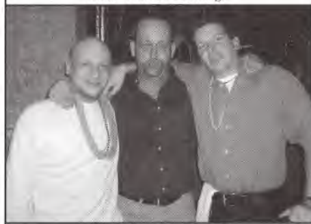
Good Times at Woody's