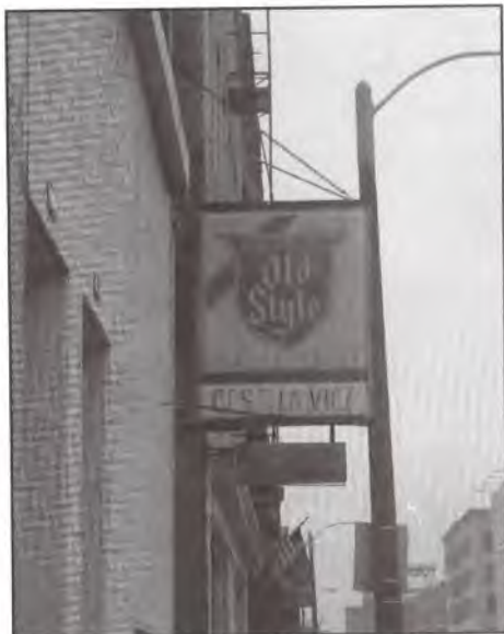
C'est La Vie, 231 S. 2nd St