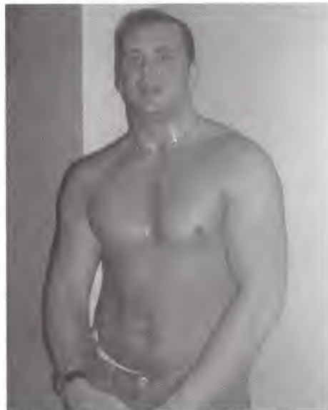
Patron at Pump's Winter Solstice Party