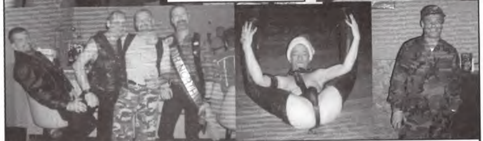
↓ New Year's Eve at The Triangle ↓