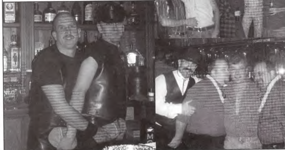
↓ New Year's Eve at Boot Camp ↓