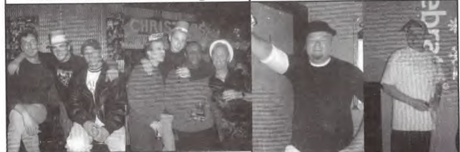
↓ BOOM! It's 2003 ↓