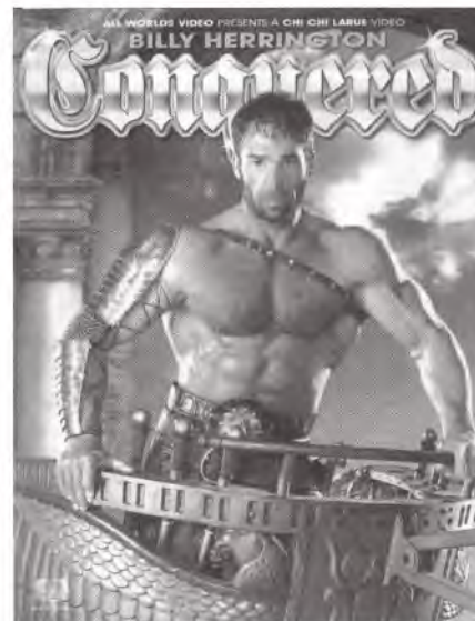
Conquered, Director - Chi Chi La Rue Studio - All Worlds Video