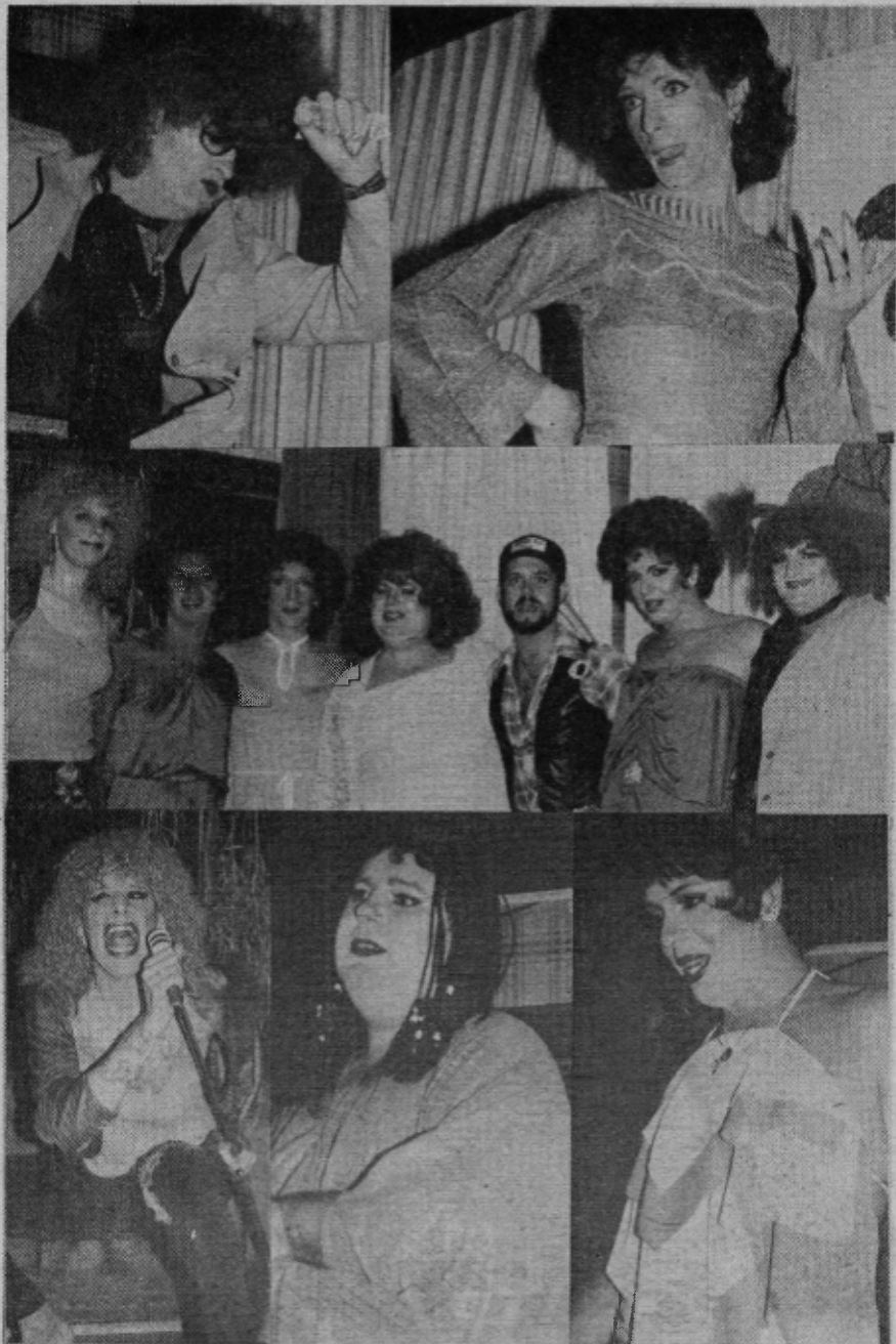
CHICAGO & MILWAUKEE PERFORMERS AT SHADOWS