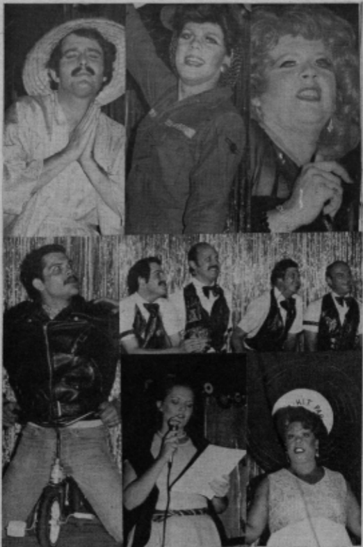
M&M HOSTED A BENEFIT SHOW FOR H.I.T.