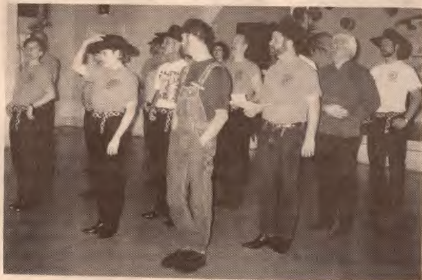
The Shoreline country dancers lead an evening of country 2-step and line dancing Saturday, March 6 at the Lake Park Pavilion. Proceeds from the event benefitted the Gay and Lesbian Support Group programs at The Counseling Center of Milwaukee.