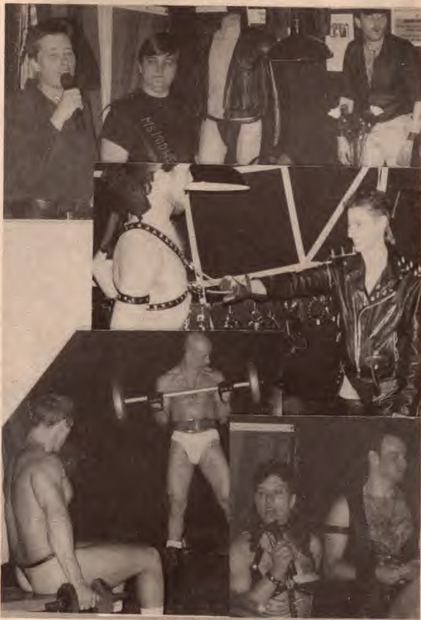
Mad for Leather , a night of leather vendors/ purveyors of toys/ and fantasy was held at Rod's. The event was produced by leatherworks.

choose to hide or come out which risks safety. This takes a lot of personal energy, and can cause great strain and stress on the individual and the relationship.