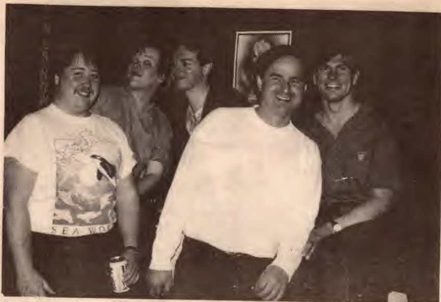
It must have been all the beer...but that's okay it was St. Patrick's festivities at Club 219 Plus.