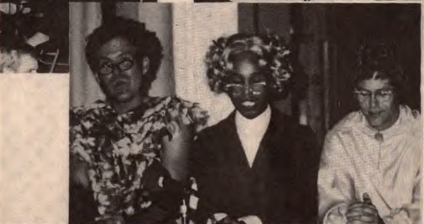
The M&M "outdoor amphitheatre" was the scene for the new season of "TV Tunes", a delightful interpretation of favorite TV shows.