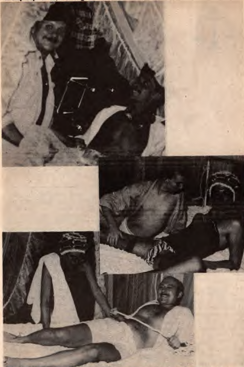
The Wreck Room's Pajama Party over Labor Day weekend was a big success. Everyone got the opportunity to try out the canopy bed, and to participate in the best PJ contest.