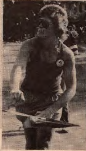
Gay Street Station celebrated their 1st Anniversary with an outdoor party, complete with cookout and dunk tank. Watch for Gay St.'s change to a new location and new name.