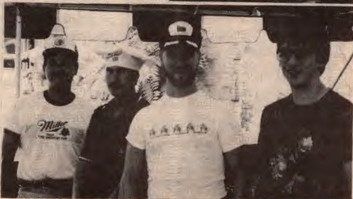
The 2nd annual M.A.P. Fest street festival on South 2nd Street was a huge success, despite the rain that plagued the daylight hours. By nighttime the rain had stopped and the area was packed.