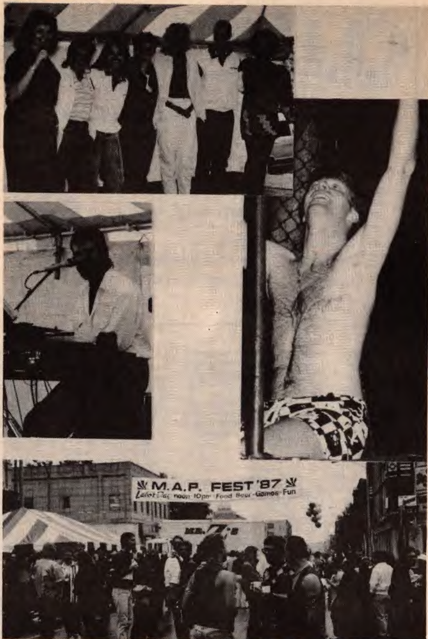
More of M.A.P. Fest '87... lots of food, dunk tank, and continuous stage entertainment made the 2nd annual event a fun day for all.