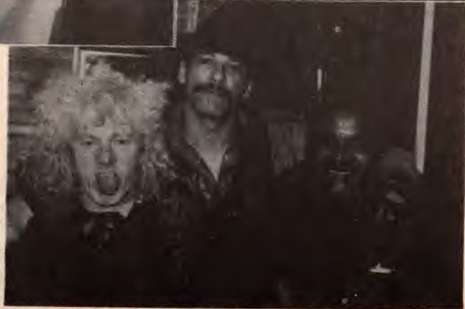
Mickey's Dynasty celebrated their Grand Opening with a Heart-On Party during Valentine's.