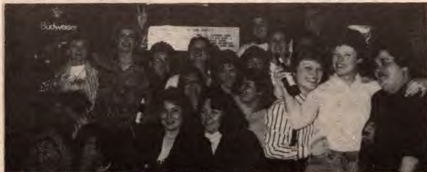
The whole gang got together at the B.G.