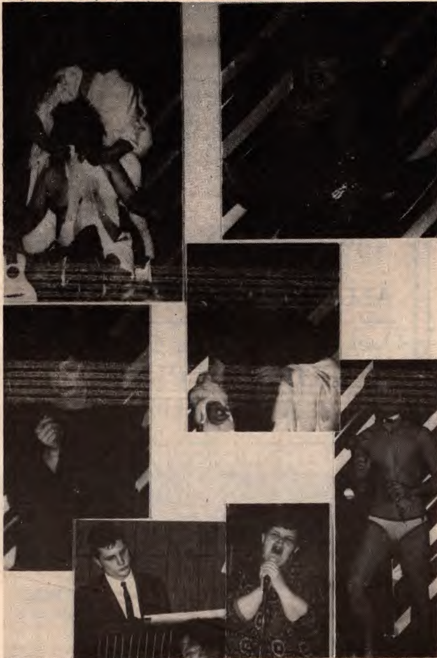
The Ballgame had a show for Valentines, featuring a variety of entertainers.