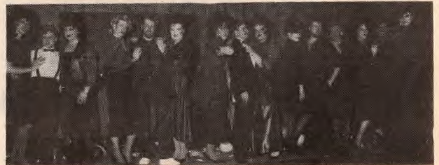
These were the contestants for the 1st annual Mr. and Miss Pivot Club contest held during the bar's 1st Anniversary celebration.