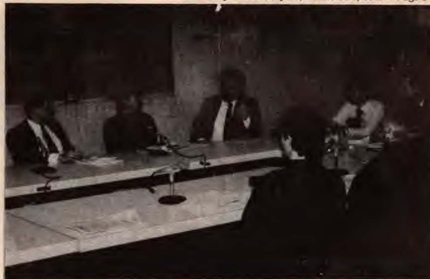
The Wisconsin Insurance Commissioner held a hearing before a hostile Milwaukee audience. Most speakers were against the use of HIV testing by insurance companies in Wisconsin. As of press time, it appeared the tests would be allowed. InStep urges you to contact your state legislators and urge them to reject the testing authorization.

SIDETRACK THE VIDEO BAR 3349 N. Halsted Chicago