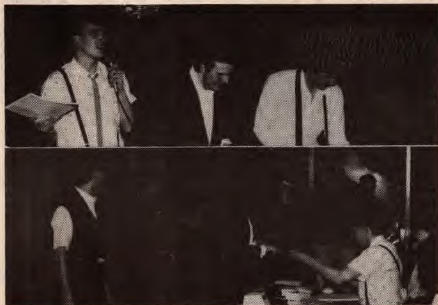
The UWM Progressive Dance brought a cross section of students and the general public together in an aura of understanding in a party atmosphere.