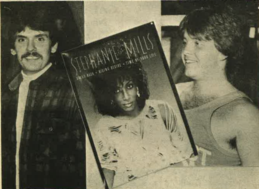
The Phoenix hosted a Wolfram Video Premiere of Stephanie Mills' newest video, along with posters, records, and other prizes.