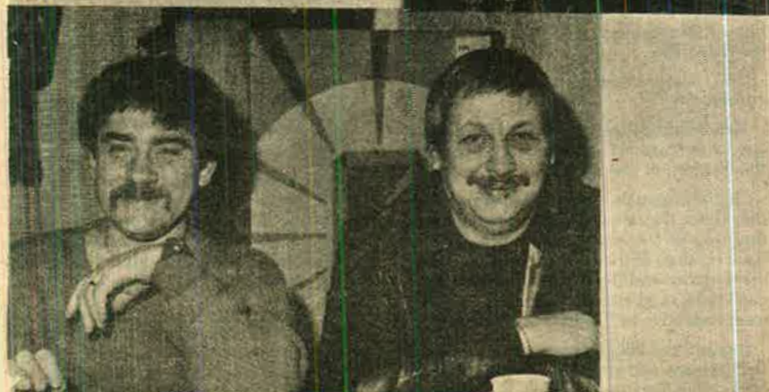
Milwaukee finally has a bar on the NW side at 44th & Fond du Lac by the name of Loose Ends.