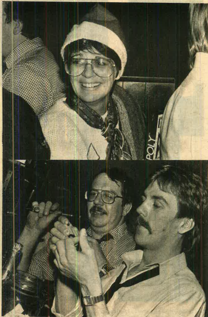
Your Place's Christmas party included drawings for presents — this woman won "Gay Monopoly."