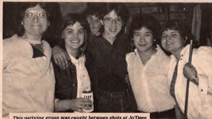
This partying group was caught between shots at Jo'Dees.