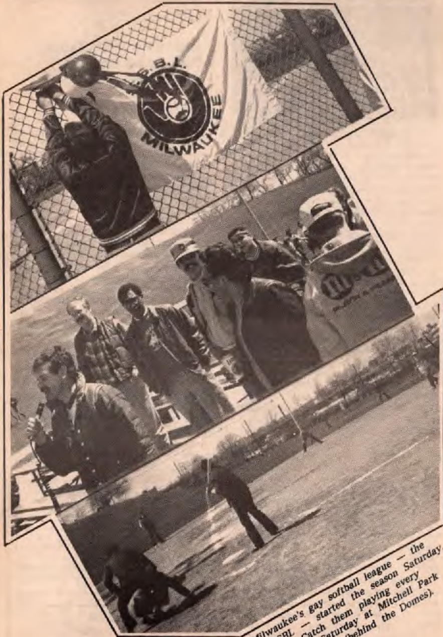
Milwaukee's gay softball league — the SSBL — started the season Saturday. Catch them playing every Saturday at Mitchell Park (behind the Domes).