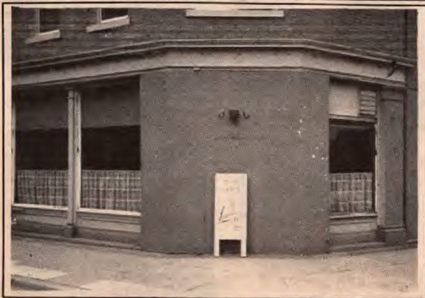
The "open window" gay bar has finally hit Milwaukee, as shown here at M&M club.