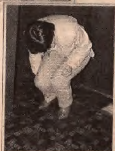
Eggies, Eggies . . . where are those eggies?