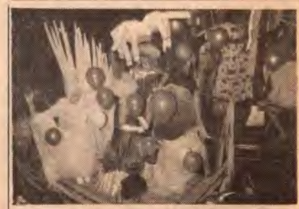
A glitzy Mardi Gras was celebrated at Club 219 with a costume contest with a $1,000 1st Prize.