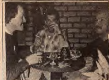
Partigoers celebrated at the Ballgame's Anniversary & St. Pat's Day party.