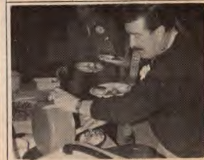
The Ballgame's celebration included a lavish buffet featuring Irish Stew (with 75 lbs. of meat) that lasted from 4 'till late in the night.