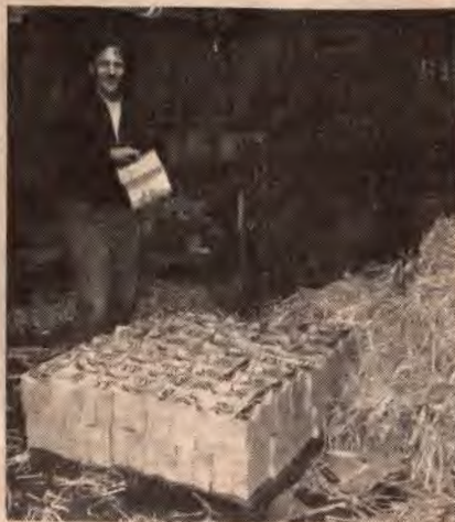
6,000 copies of issue #1.