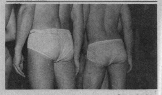
We realize that this is supposed to be shots from a wet jockey shorts contest, but frankly, this photographer just could not resist.