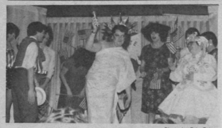
ECOM presented a "Salute To Broadway" held st the Ball Game, in the photo above is the finale with the statue of liberty arriving on stage. All proceeds went to the Gay Pride Week Comm.