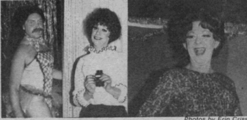
Milwaukee is known for lots of outstanding entertainers and we want to share with you a look back at some of those great moments.