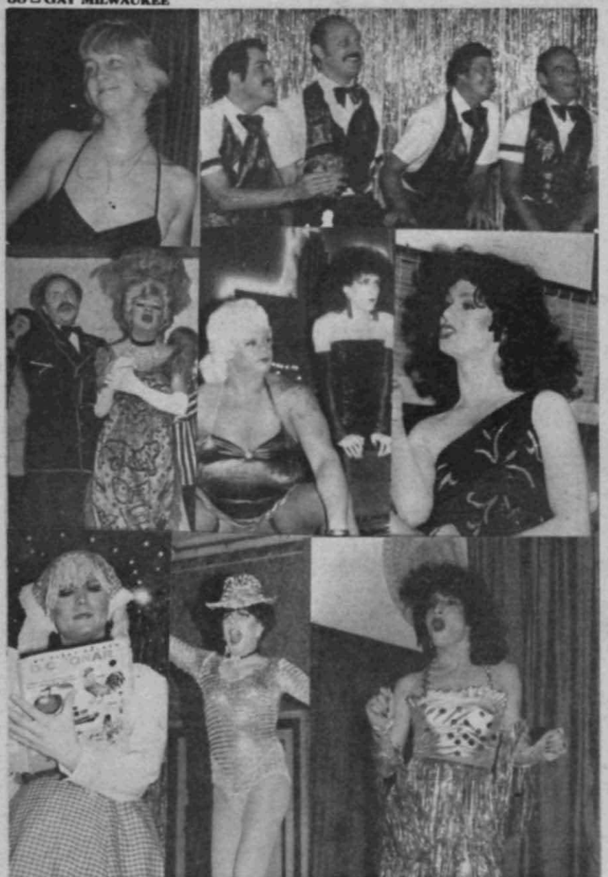
Milwaukee is known for lots of outstanding entertainers and we want to share with you a look back at some of those great moments.