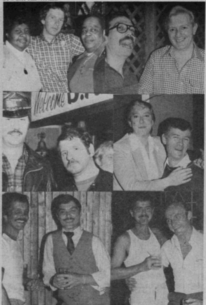
Just a page of smiling faces for old times sake.