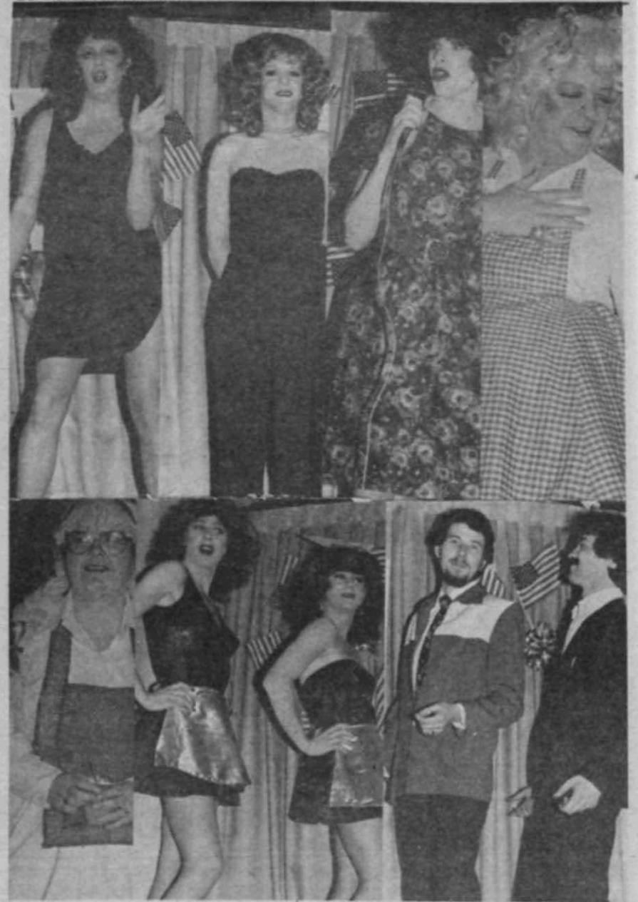
ECOM presented a Salute to Broadway, held at the Ball Game as a benefit for the Gay Pride Comm.