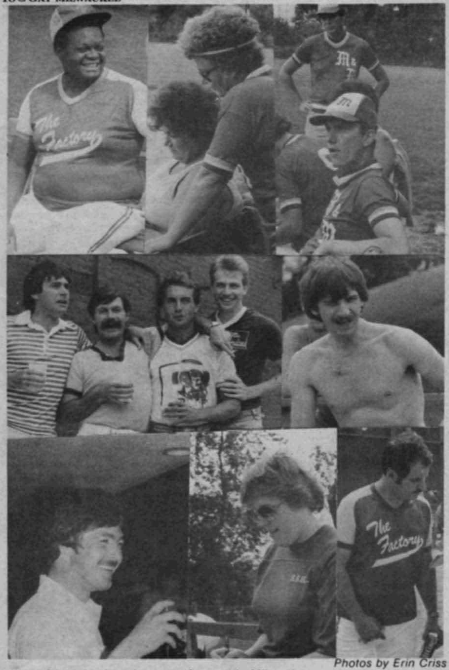
A brief look back at the year of sports in Milwaukee.