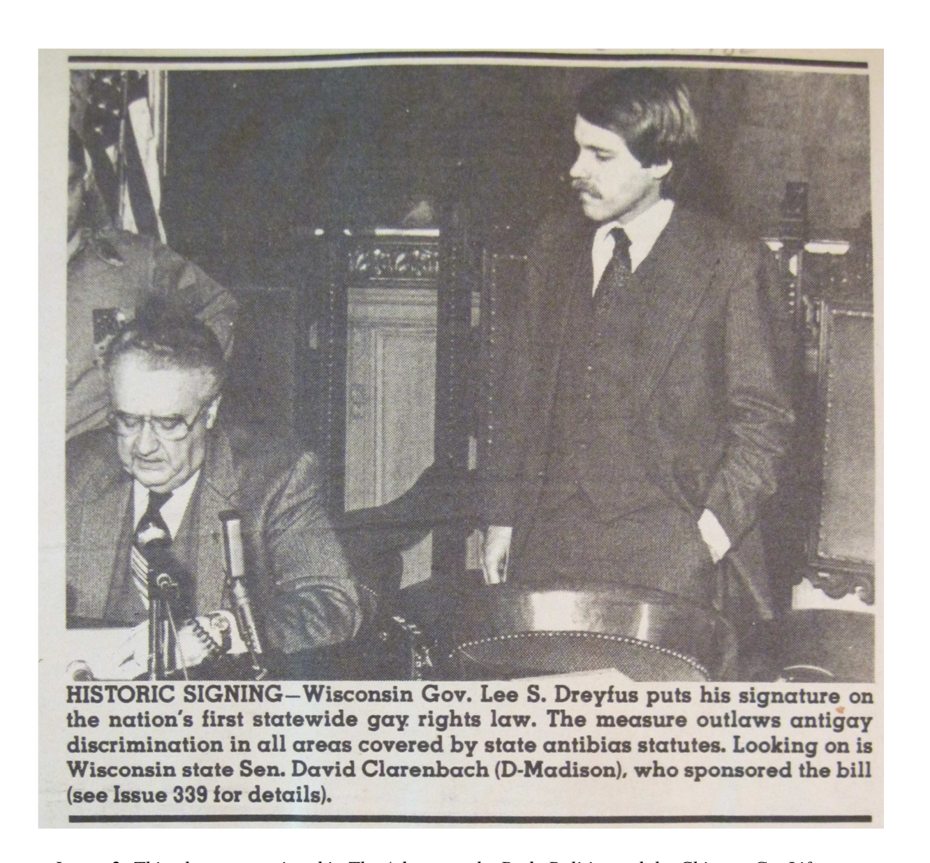
Image 2: This photo was printed in The Advocate, the Body Politic, and the Chicago GayLife.