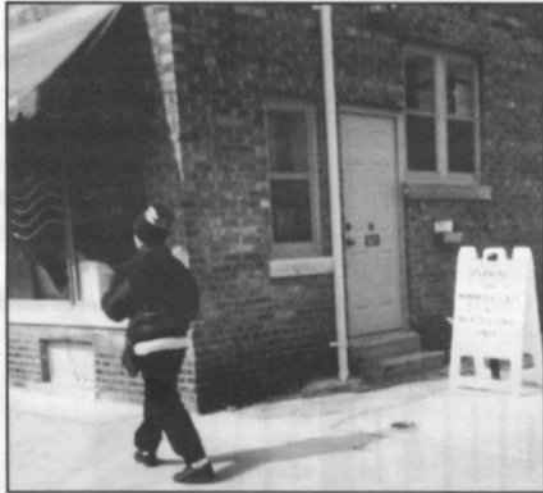
BestD Clinic, 1240 E. Brady, where Bi Definition meets at 7 p.m. every first Saturday and third Tuesday of each month.

Bisexuality: The potential for physical, romantic or emotional attraction to more than one gender