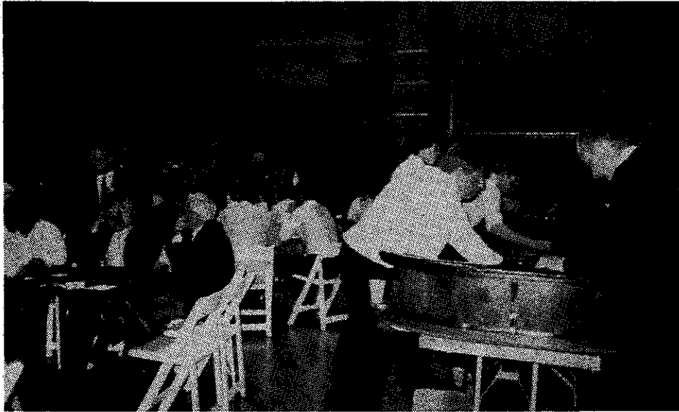
CCF's photo review of Casino '87