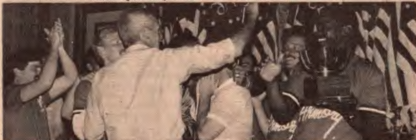
Armory, Atlanta, pulled into a close third place in the Classic.