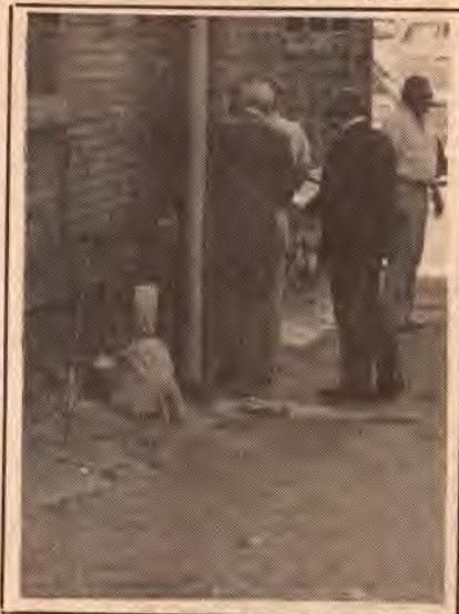
One of the Milwaukee pipe bombs was found in this alley off 3rd St., north of State. Law authorities detonated the device.