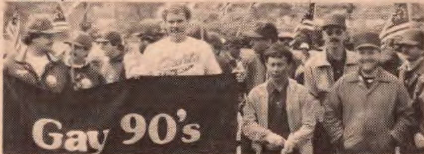
Minneapolis Gay 90's came in 2nd Place in the Classic.