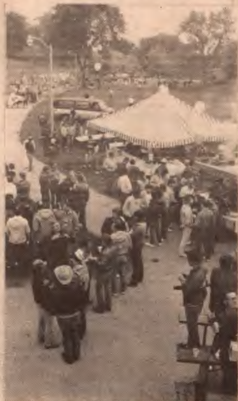
All the teams prepared to "parade" onto the field for the opening ceremonies.