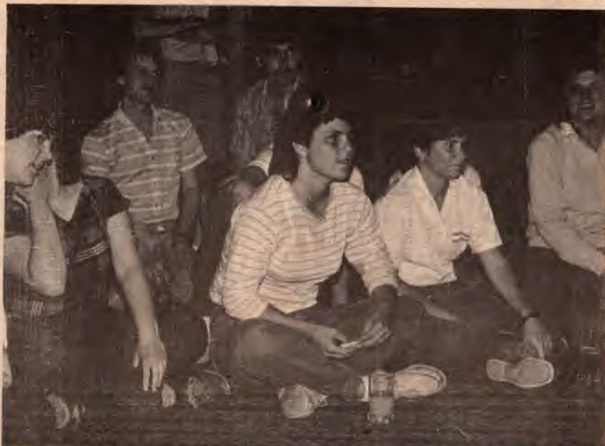
These women enjoyed the show at the Factory II's "Girls Just Wanna Have Fun" party.