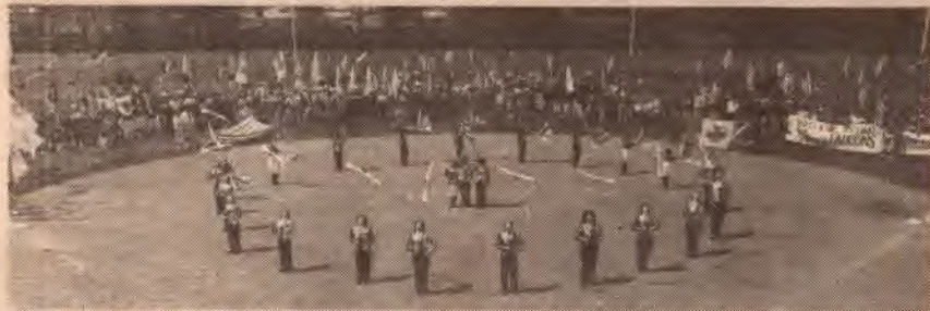
The opening ceremonies were extremely colorful — in this photo the drill team exhibited their technique.