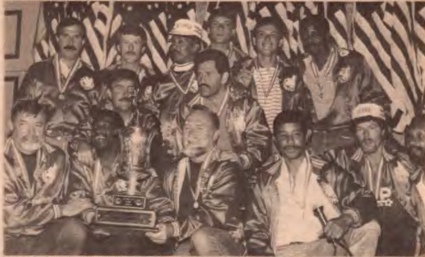
Griff's from Los Angeles is the 1984 Milwaukee Wreck Room Classic Softball Tournament champions.