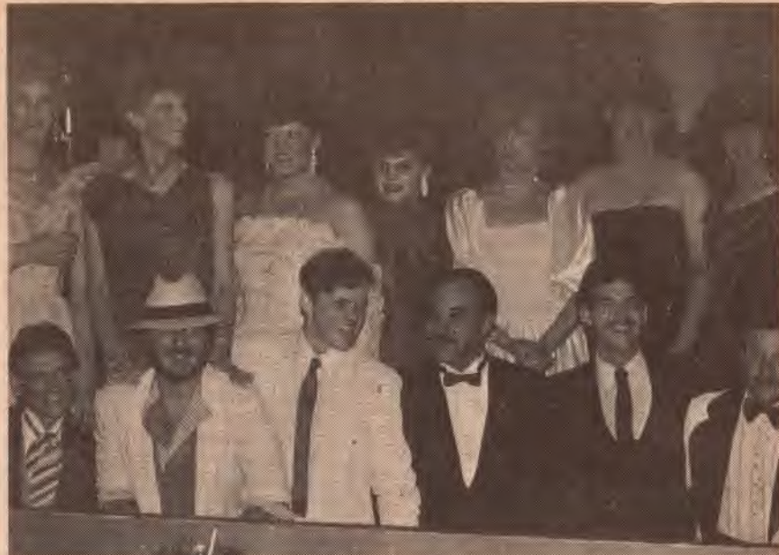
The contestants in the Mr. & Miss 1101 West Contest.