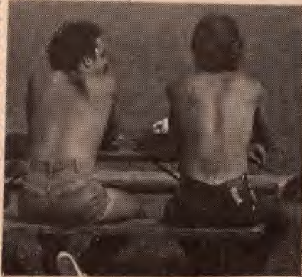
Men . . . summer . . . and Lake Michigan.