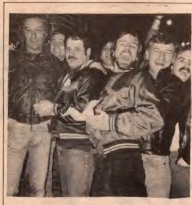
This group of Milwaukee bar owners and workers were caught between the stops on the BAM Bar Crawl.