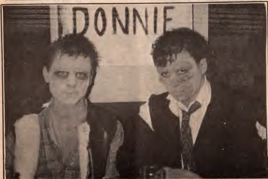
These two ghouls crept around the Factory's Thriller Party.