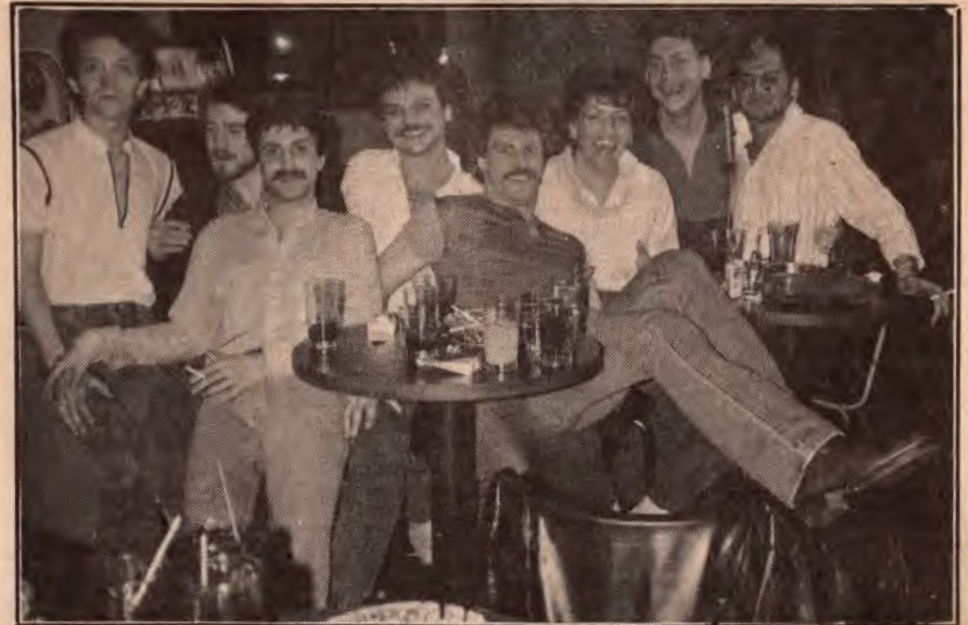
This bevy of (predominantly) brawny bodies were persuaded to pose for this pic while they were partying at La Cage Aux Folles.

WisconsIn Step 823 N. 2nd St., Ste 409 Milwaukee, WI 53203