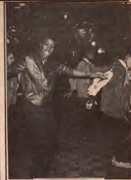
A Michael Jackson impersonator along with her accomplished backups: "The Thriller Dancers" at the Factory II's Party.