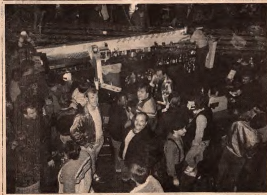
Inside Trianon, filled with BAM Bar Crawlers.