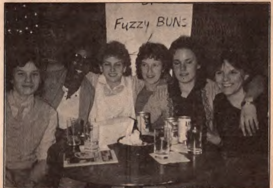
This group of women had serious party intentions when In Step caught them at the Factory II's party.