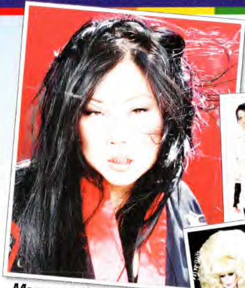
Margaret Cho - FRIDAY