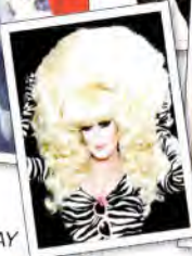
Lady Bunny - FRIDAY