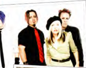
Berlin - SAT.