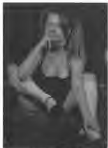
Jenny Price Guest Photographer

Sunday, July 24th - 9 pm Show Talent Search - 11 pm