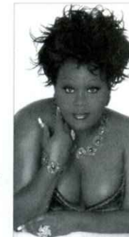
TAJMA HALL MISS CANADA CONTINENTAL PLUS 2005